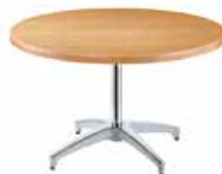
BUTCHER BLOCK-TOP CAFÉ ESSENTIALS 72063