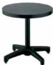
BLACK-TOP CAFÉ ESSENTIALS 72069