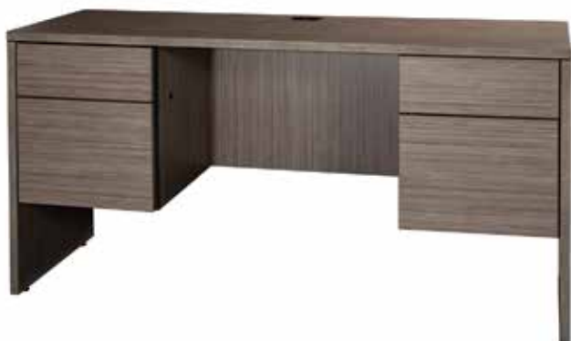
MADISON DESK SELECT gray acajou 84075