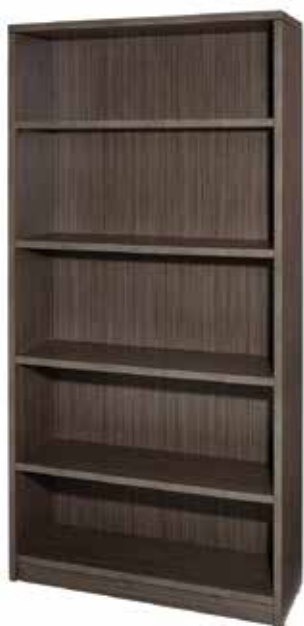
MADISON BOOKCASE SELECT gray acajou 84078