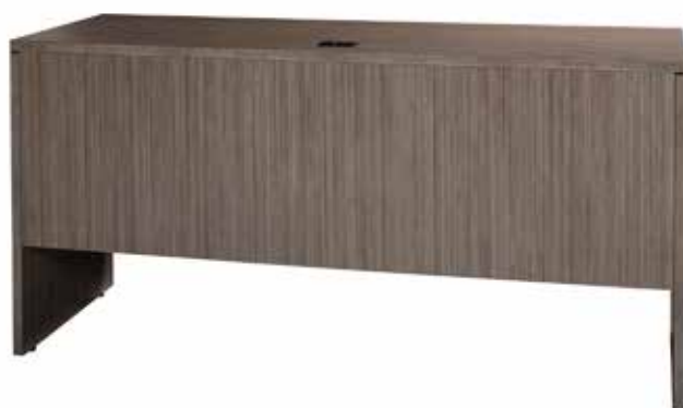
MADISON CREDENZA SELECT gray acajou 84077