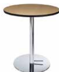
HYDRAULIC BASE CAFÉ TABLE SELECT maple 8201208