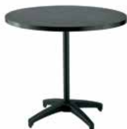
BLACK-TOP BISTRO ESSENTIALS 72070