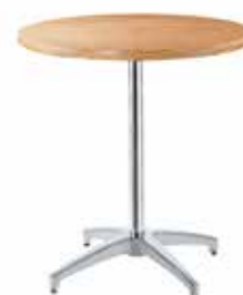
BUTCHER BLOCK-TOP BISTRO ESSENTIALS 720163