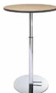
HYDRAULIC BASE BAR TABLE SELECT maple 8201207