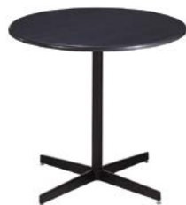
STANDARD BASE CAFÉ TABLE SELECT blue steel 8201203