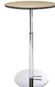
HYDRAULIC BASE BAR TABLE SELECT maple 8201207