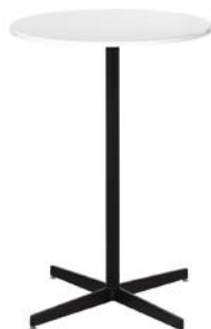
STANDARD BASE BAR TABLE SELECT liquid white 820231