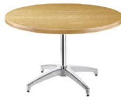
BUTCHER BLOCK-TOP CAFÉ ESSENTIALS 72063