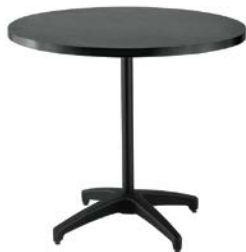
BLACK-TOP BISTRO ESSENTIALS 72070