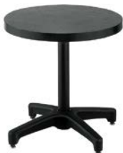
BLACK-TOP CAFÉ ESSENTIALS 72069