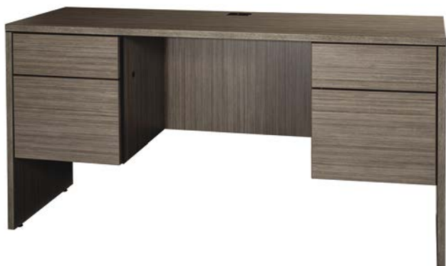
MADISON DESK SELECT gray acajou 84075