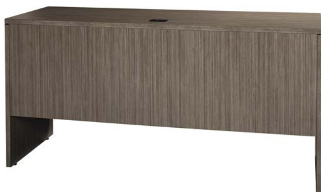
MADISON CREDENZA SELECT gray acajou 84077