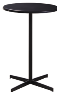
STANDARD BASE BAR TABLE SELECT blue steel 8201204