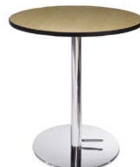
HYDRAULIC BASE CAFÉ TABLE SELECT maple 8201208