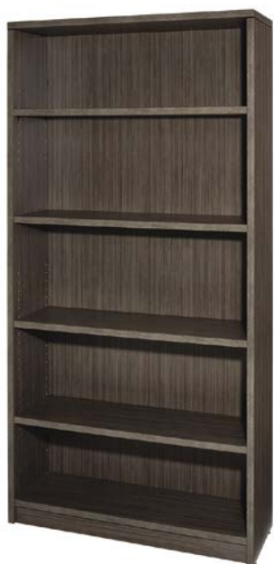
MADISON BOOKCASE SELECT gray acajou 84078