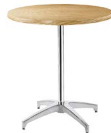
BUTCHER BLOCK-TOP BISTRO ESSENTIALS 720163