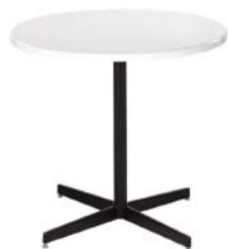
STANDARD BASE CAFÉ TABLE SELECT liquid white 820232